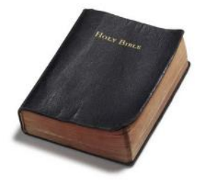
The Bible is the Word of God